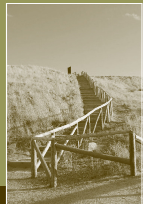
Hard working NCCC volunteers helped install a hand-rail down the bluff stairs.>

By donating things that BLNC can use, you can help us save money. A few of our current wish list items include: binoculars for students; sturdy tools and heavy work gloves; and gift cards (Hobby Lobby, Office Depot, Home Depot, etc.).