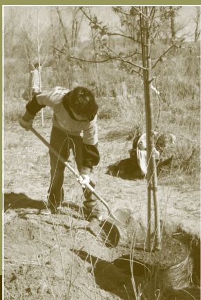
<Volunteers helped plant 200 native trees and shrubs at Bluff Lake during 2010.