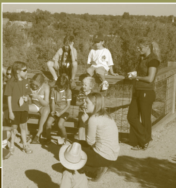
<Kids at Bluff Lake learning about the natural world and defeating nature deficit disorder.

Board of Directors Site Management Education Program Volunteer Involvement Major Donors Financials Partnerships Things to Watch for in 2011